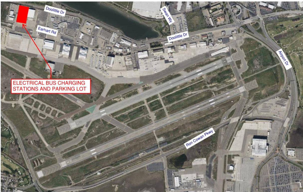
Figure 1. North Field Electric Bus Charging Depot Location.

Future replacement shuttles will be purchased in the coming years until the entire fleet is zero-emissions. To accommodate the need to charge the electric buses, Port Staff went through a planning and design process culminating in the identification of a bus charging depot, as shown in Figure 1, and the design of the required civil and electrical improvements to support Airport bus operations, bus parking and bus charging, as shown in Figure 2. The capacity of the charging depot was sized for a combined fleet of 40 buses to accommodate future growth of bus operations.