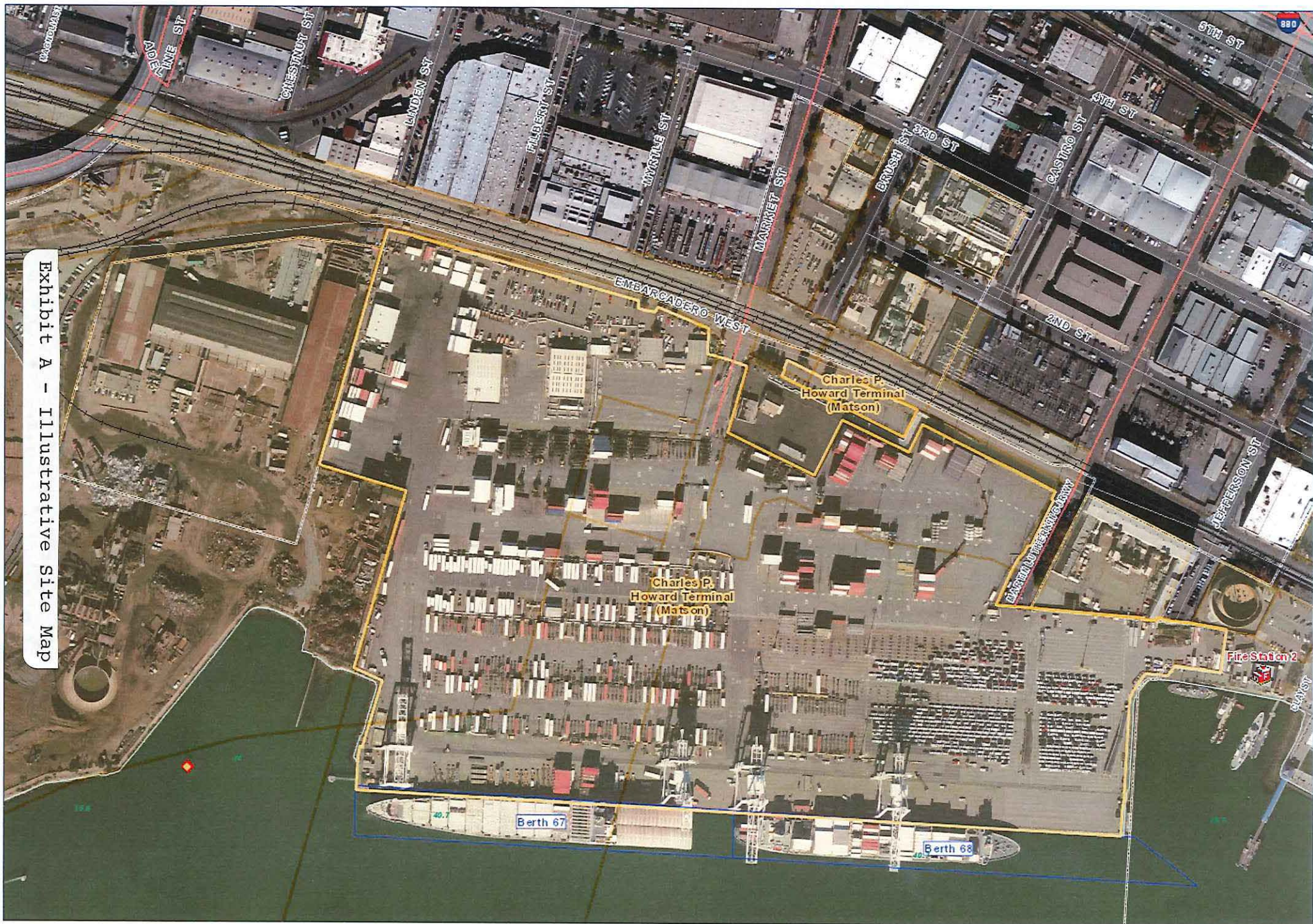
Exhibit A - Illustrative Site Map